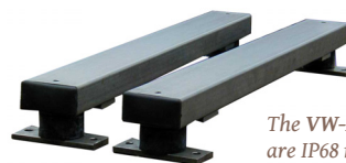
The VW-AG stainless steel agricultural weighbeams are IP68 rated and sealed at either end, making them ideal for demanding agricultural environments.