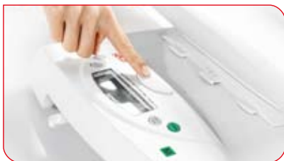
The weighing tray can be removed quickly and easily at the touch of a button.

In no time at all, the baby scale can be converted into a floor scale: pressing a button unfastens the mechanism attaching the tray to the base. When locked, this secure attachment ensures that the baby scale is easy to lift and safe to transport.